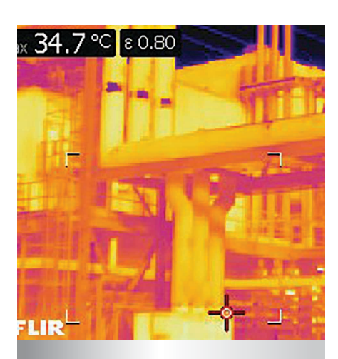
Thermal scanning of critical power equipment is available.