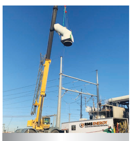
Bus solutions include installations, modifications and retrofits