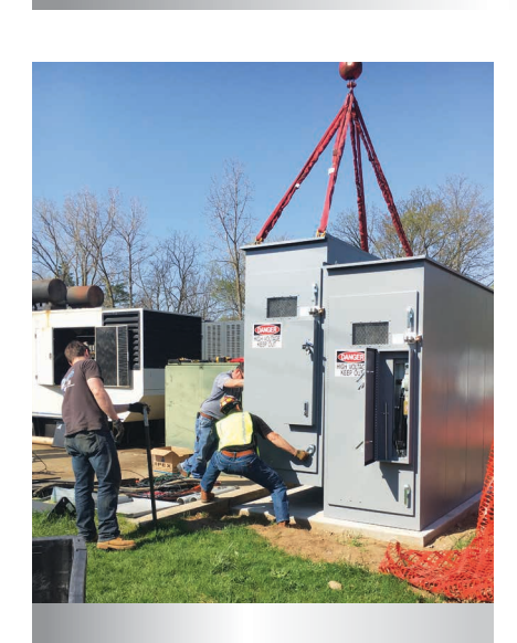
Engineering solutions include system designs and retrofits.