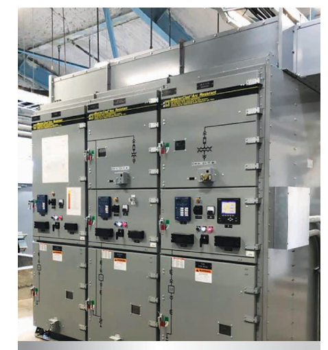
Our services focus on building reliability and redundancy for critical power systems.