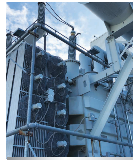
A full range of transformer solutions is available from our experienced teams.