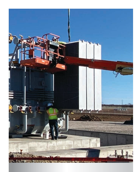
Repairs and maintenance can be performed on any OEM transformer.