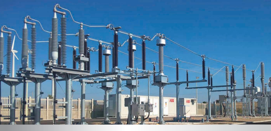
Services include substation apparatus and Protection and Control commissioning.