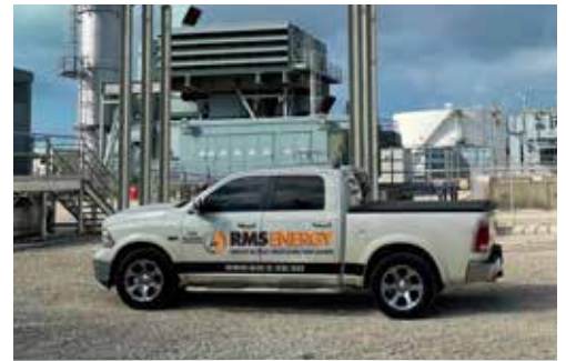
FIELD / COMMISSIONING